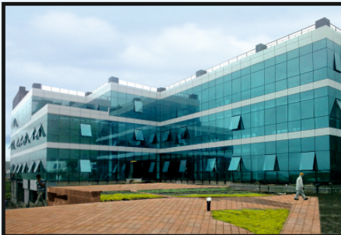
Fulcrum | Pune