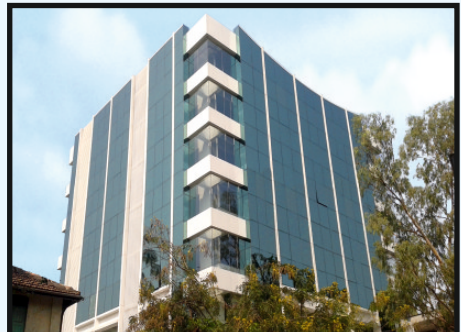
Relcon House | Vile Parle