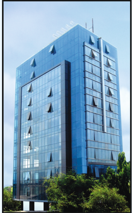
Atlanta | Goregaon (East)