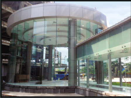
Larsen & Toubro | Powai