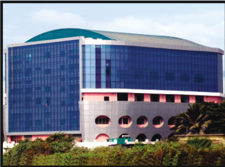
Agri-Koli Sanskritik Bhavan | Kharghar