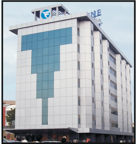
Hotel Garodia | Shirdi