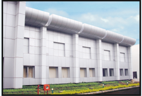
RBI | Kharghar