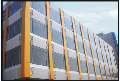
Bhavani Plaza | Dadar