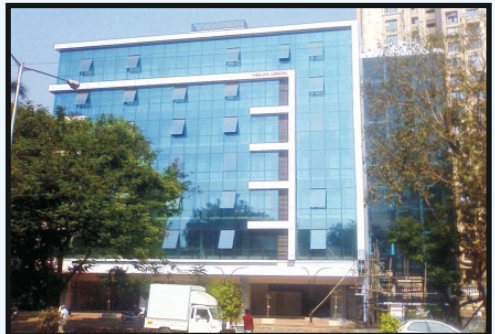
Safal Pride | Chembur