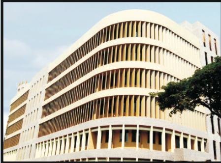
Ward Office | Goregaon