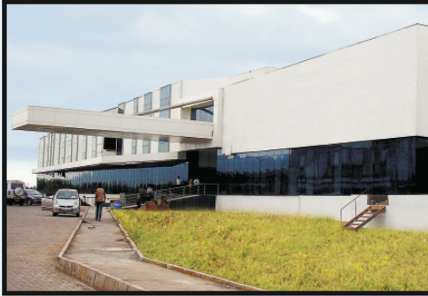
Asian Paints | Turbhe