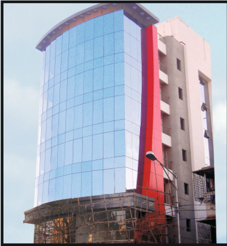
Prabhat Chambers | Khar