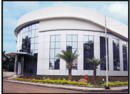
RBI | Kharghar